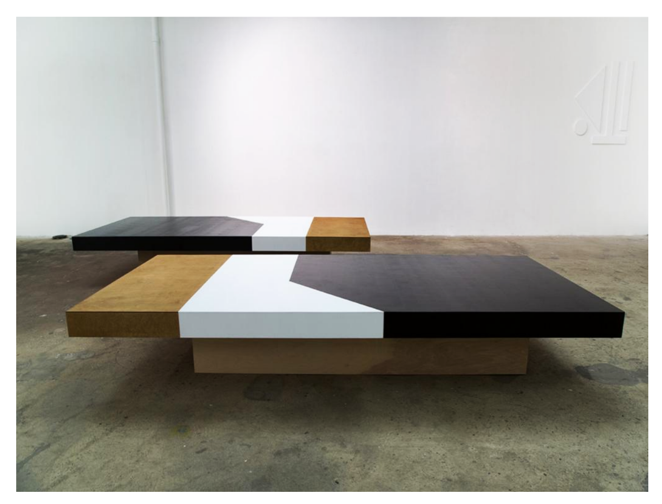
Bed I, Bed II, from the project Kirscallee, 2017, Installation view