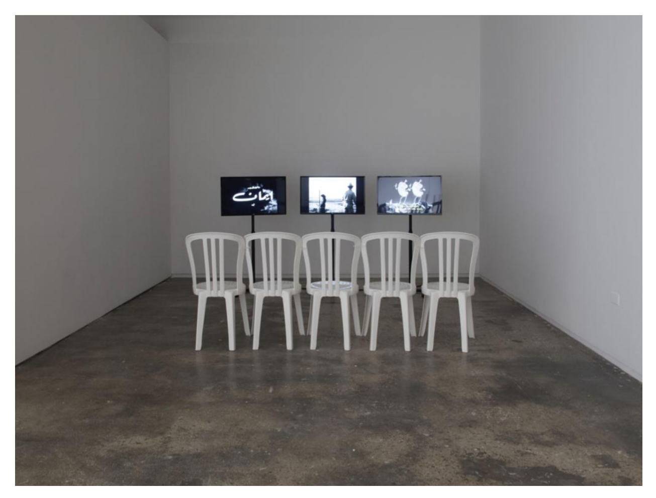
Maybe That's What it Means, 2018, Installation view