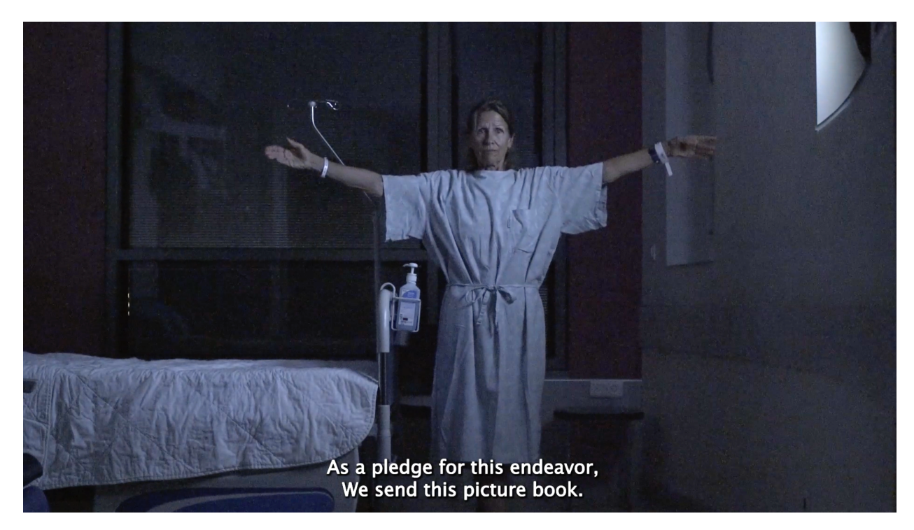
Still from A-Mid Summer Afternoon's Dream, 2021