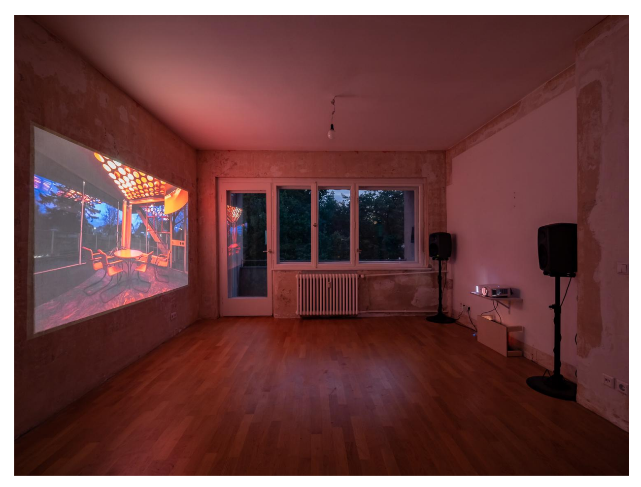
Lorimer & Metropolitan Ave (ft, Kirschallee), 2021, Installation view